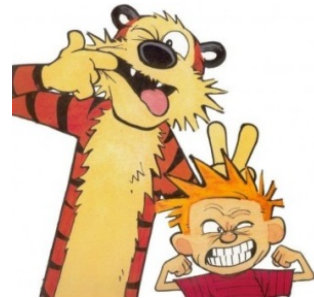
Kellie Cleaver FERM Student Workers